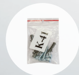
K-41 screw kit