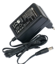
24 V 0.8 A power adapter