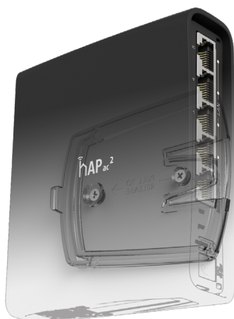
Can be attached to the wall.

The hAP ac 2 is preconfigured, so all you need to do, is plug in the Internet cable, the power, and start using the internet by connecting to the MikroTik network.